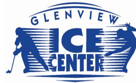
Figure Skating Lessons